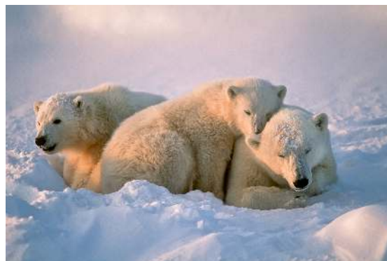
A polar bear snuggles with her cubs.

For World Wildlife Day today, Tuesday, March 3, we're revisiting a classic Tiny Show & Tell Us episode that celebrates curiosity about the natural world. It features a listener who was once told — incorrectly — that polar bears don't have black skin, plus a dive into the hidden world of insect vibrational communication, a tiny, sensory universe. It's a fun reminder that wildlife is full of surprises! Listen here >>>