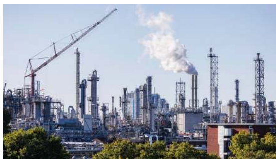
BASF has announced plans to expand production of BDO in Germany.

European leaders are moving to shore up the region's struggling chemical sector, pledging regulatory relief and greater backing for low-carbon investments. The European Commission also imposed antidumping duties on ABS, or acrylonitrile-butadiene-styrene, from South Korea and Taiwan and on 1,4-butanediol (BDO) from China, Saudi Arabia, and the U.S., aiming to counter a surge in low-priced imports.